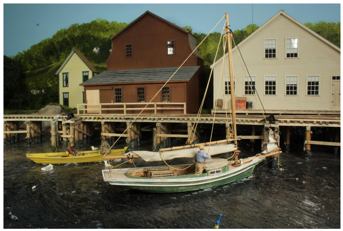
Figure 1 - The Denny McGonigle is preparing to get underway to work the lobster traps.

I completed a scratch-built diesel switcher that qualified me for the Motive Power AP certificate. This is my 10<sup>th</sup> certification.